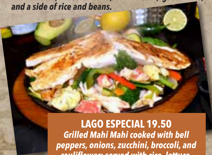
LAGO ESPECIAL 19.50 Grilled Mahi Mahi cooked with bell peppers, onions, zucchini, broccoli, and cauliflower; served with rice, lettuce, sour cream, shredded cheese, Pico de Gallo, and flour tortillas.